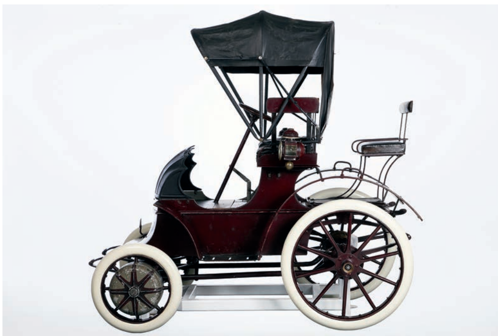
A two-seater cabriolet Lohner-Porsche electric car (1899–1900) in Vienna’s Technical Museum (photo © Technisches Museum Wien).

Spurred on by this success, Porsche jumped ship to join Lohner. Over the next couple of years, the two men broke new ground with a series of electric vehicles under the Lohner-Porsche name. These made use of Porsche’s first great innovation,