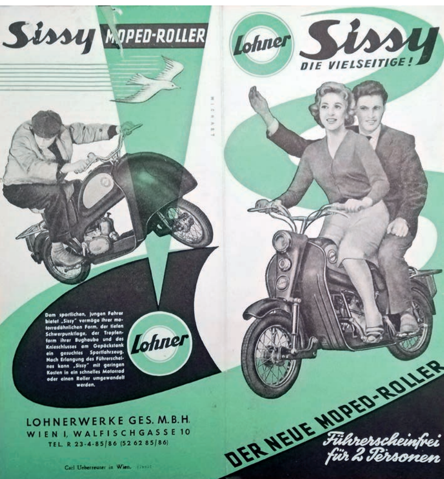
LEFT: A Lohner Sissy sales brochure from the 1950s (photo © Archiv Lohner, Wien).

After the Second World War, Lohner remained in public administration until 1949, when it was returned to the family. A year later another chapter opened for the company with some very different products: motor scooters and mopeds.